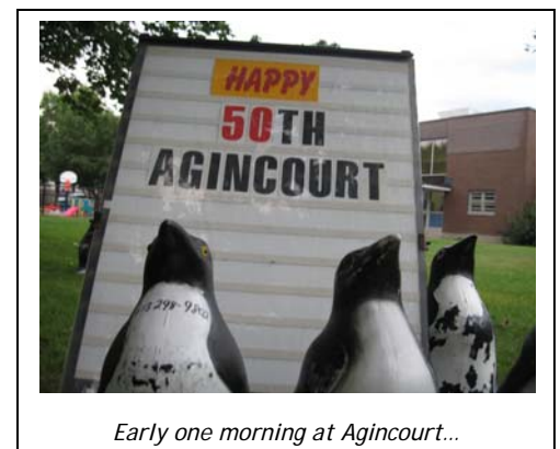
Early one morning at Agincourt...

The Drama Club is running again this year. They will begin practising a play titled Great Scientific Breakthroughs. It is a comedy about famous scientists and their discoveries. Interested students have had a chance to audition for both dramatic and dance roles.